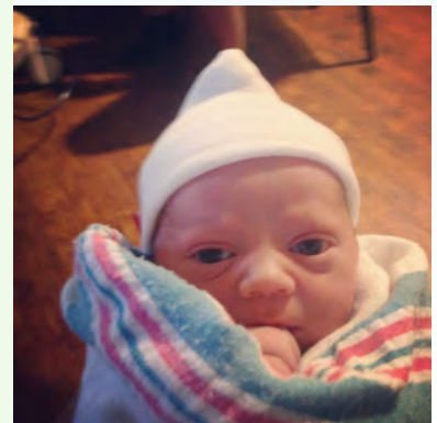
Welcome to the World!